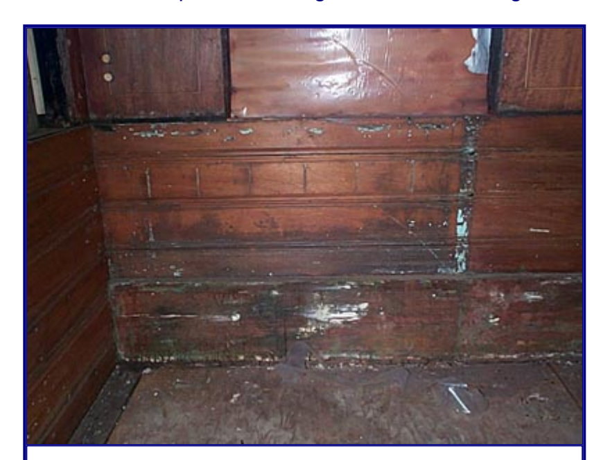
Original wainscoting and base board patched with plaster of Paris, evidently a Steamtown fix. Reasonably effective under paint, but not acceptable with a clear finish.

medium powered router and a home made table with extensions. Working slowly and with two featherboards, I was able to produce enough of the wainscoting to finish the side.